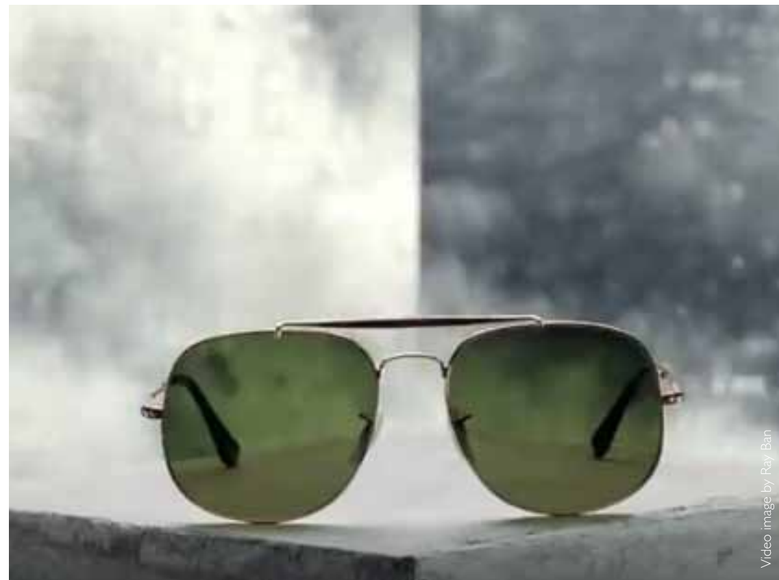
Video image by Ray-Ban